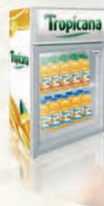
Counter Top Chiller Unit*

Width: 863mm Depth: 889mm Height: 1830mm Weight: 100.5kg - 270 Bottles