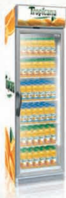
Floor Standing Chiller Unit*

Width: 600mm Depth: 690mm Height: 2050mm Weight: 100.5kg - 311Bottles